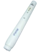
e 2 sense

The Z10 LPG boat alarms with remote sensors are designed to give an early warning of LPG leaks on boats and come in single or dual sensor versions, which can operate from a 12-24V DC power supply.