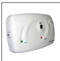
Hard wired Carbon Monoxide Alarms